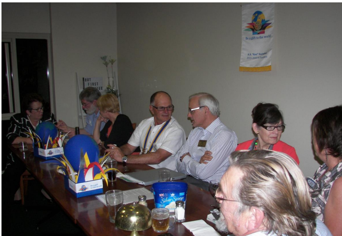
Last Tuesdays meeting at Beechworth Rotary Club. With Our DG, AG & Presidents from Bright, Mytleford and Beechworth