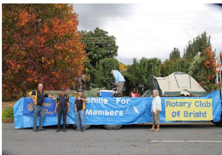
Putting the final touches On the float and filling the Eskeys