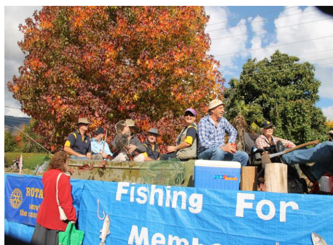
Everyone in their place And all ready for the off