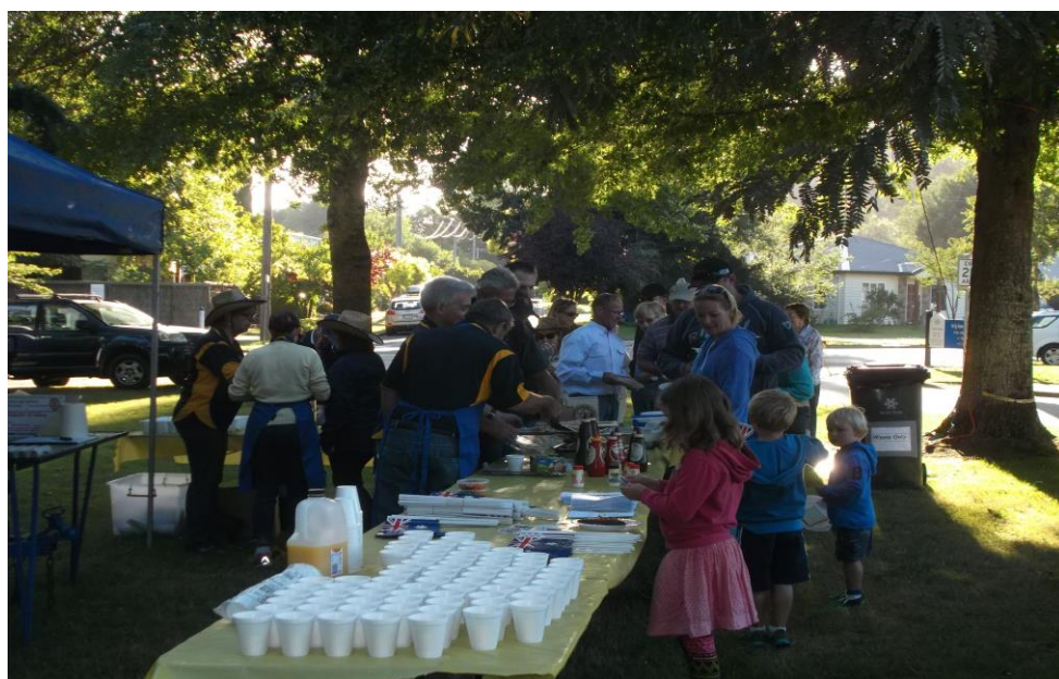
The Team at work during this Mornings Australia Day Celebrations