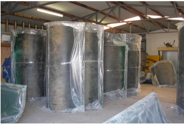
Above:- The arrives back in Bright