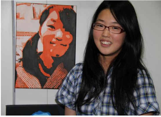
Minori's Art on display at the Bright Art Gallery