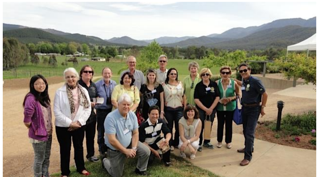
Brazilian Families and their Hosts at the Deer Farm