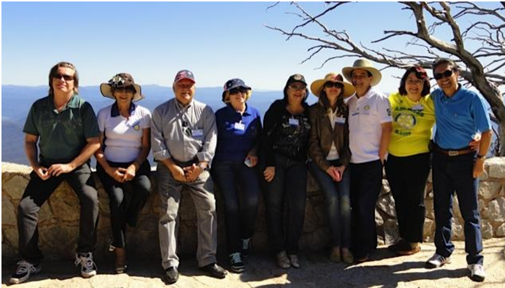
Our Rotary Friendship Exchange Group from Brazil at the Horn on Mt Buffalo