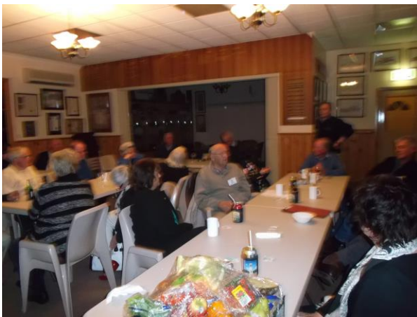
Members And Guests Enjoying An Evening Of Fellowship At The Bright RSL