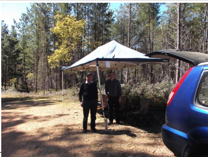
Just of Mystic Lane